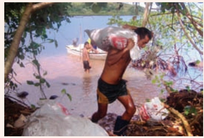
Youths helping with the building.

Youths on Rabi Island, thanks to OLSH Overseas Aid, were able to create an income-generating project by constructing a concrete piggery. This piggery is designed to fund some of the social needs of the young people on Rabi Island.