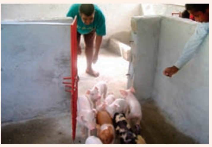
Piglets entering their new home.