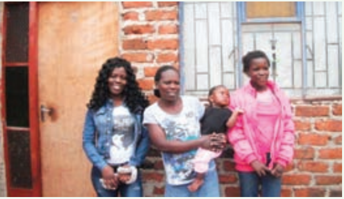
A new door provides more security for this young family