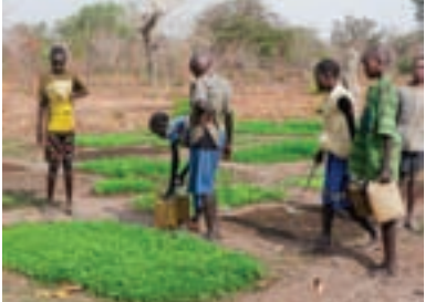
Satellite school garden.