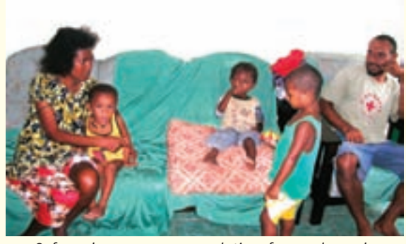
Safe and secure accommodation for rural people needing medical attention in Port Moresby.

Permission has been given to use this photo.