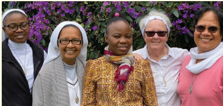
Five Sisters, Five Cultures, One Charism

We are five OLSH Sisters in South Africa. We are hoping other Sisters from the African Province will soon join us once visas begin to be issued again. In the meantime, we are doing all we can to continue our mission, especially to orphaned and vulnerable children in various locations in Limpopo.