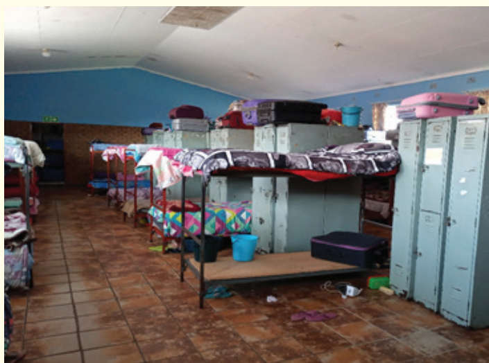
Dormitory in need of refurbishment