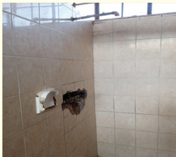
Dormitory showers need repair