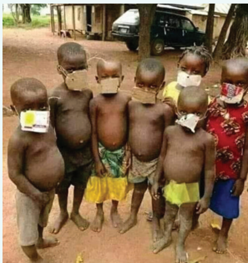
These small youngsters from a nursery school in Rumbek, display their efforts to avoid the virus

out economically for boys' shorts, blouses with collars and skirts with pockets. With your assistance for Women's Development I was able to purchase two treadle sewing machines and an initial supply of material. Within a few months we hope they will be self-sufficient. Thank you for your kind assistance which makes such a difference to women's lives.