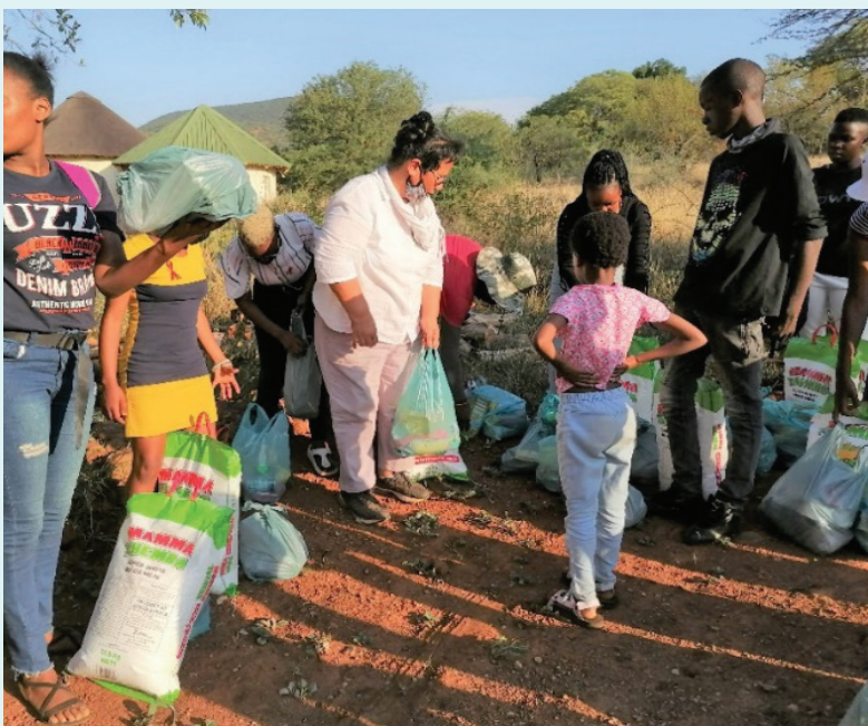
Celebration of HIV/AIDS Day with Food Parcels