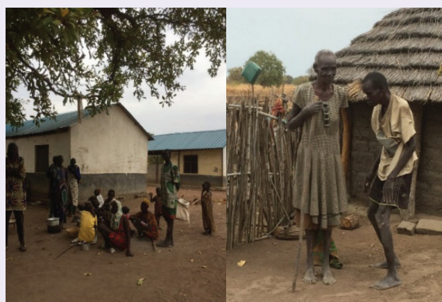
Care for the Poor Supported through Emergency Rations

We are supporting approximately another 55 other fragile, mentally and psychologically unwell, poor, widowed, lame, and deserted people, who are no longer able to produce sufficient food to survive. They go to local restaurants where they receive a generous serving of food once per day for 350ssp (87 cents US) for each food service.