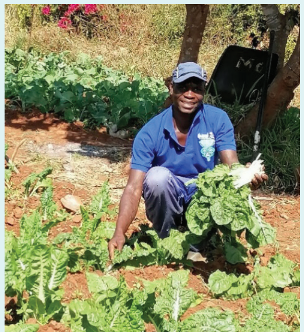
Harvesting Vegetables for OVC Food Parcels