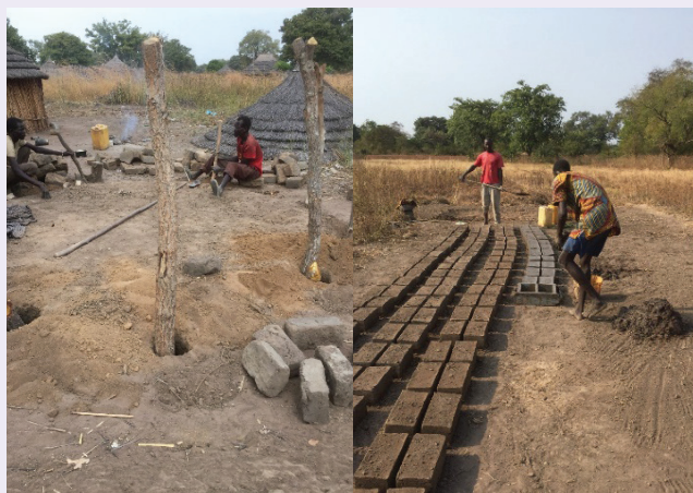
House Repairs to Tukul affected by Torrential Rains/Flooding

In October and November torrential rain and flood greatly affected Panamat; home to those affected by leprosy. Many of the houses remained in water almost one metre deep due to the flooding. The mud block walls dissolved and crumbled, and we are still in the process of rebuilding their houses.