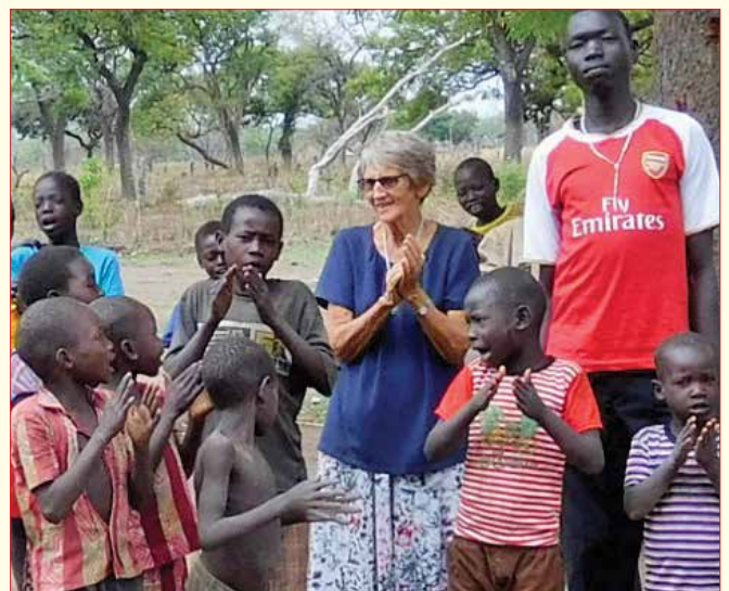
School children from Mekerri in Jur