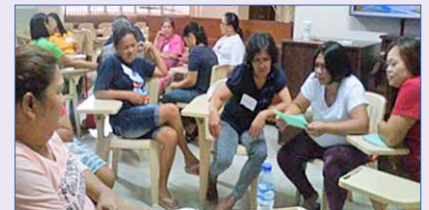
Parenting Session with mothers