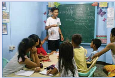
Tutorial Program facilitated by the Scholars in Matang tubig