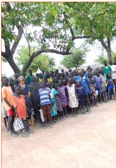
School children in Jur area

An ecumenical group led by Bishop Paride Taban, recently visited Pope Francis pleading for the presence of all churches in the country to continue. They are currently the only effective bodies maintaining solid educational services, teacher training and school administration. Health care training is also a major ministry. With growing emphasis on agriculture, which combats hunger and dependency on handouts, we are proud to be part of this effort. Norwegian Peoples Aid brought sixty women to our fully irrigated garden for an in-service training on small scale vegetable production. A special thank you to our donors for providing this garden and funding the training of agricultural officers.